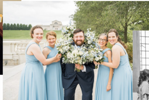
Above: Bridesmaids + groom at the Grand Basin in Forest Park. Right: Bride, bridesmaids, and flower girl in matching PJs before getting dressed at church.